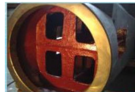
COLUMN: box structure, increase rigidity