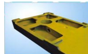
BOTTOM : box structure,

Manual 1-Shot Lubrication System - Automatic Optional 35 Watt Halogen Work Lamp - 50 Watt Optional Draw Bar, Tool Box With Operation Manual And Test Data Includes Leveling Pads - Lift Eye - Rear Ram Eye SC250 Superior Rigidity - Uniquely Structured Castings