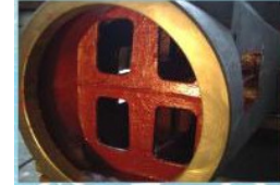
COLUMN: box structure, increase rigidity